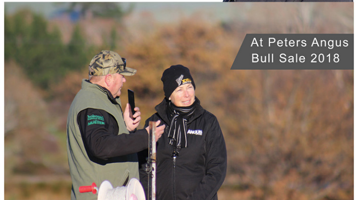
At Peters Angus Bull Sale 2018