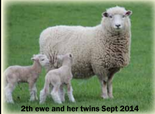
2th ewe and her twins Sept 2014

As I'm sitting down to write this (mid August) it's windy and cold, there is snow lying on the ground, the water tables are topped up once again, creating more mud (if only mud made money!) and Heriot just lost the South/West rugby final to Lawrence/town!