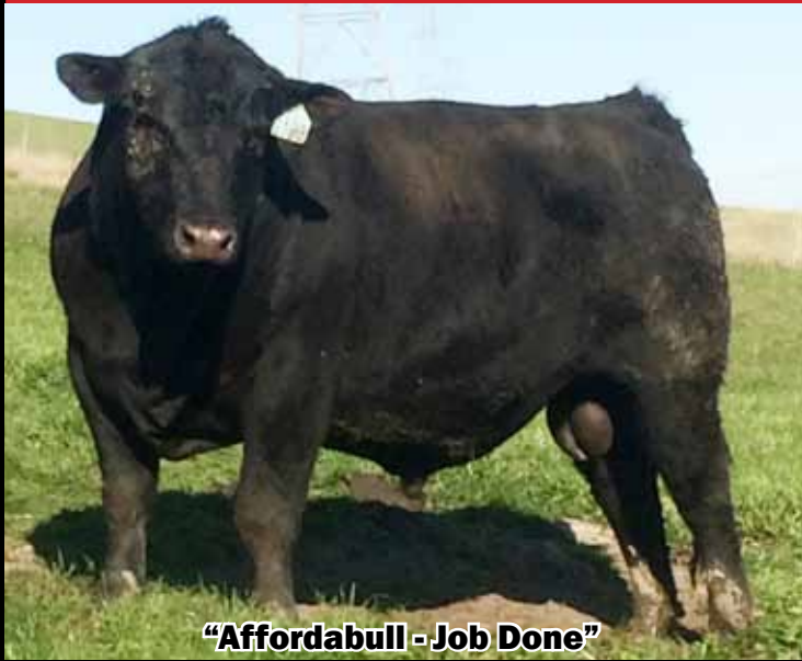
"Affordabull - Job Done"

"We've taken care of the wintering so the hard work has already been done. The bulls are simply set to go out and do the job. Our clients don't have to pay for the bulls until October which also helps their cashflow. It's our point of difference that works well and keeps the farmers happy."