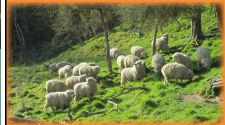
Sue's ewe hoggets at home

Enclosed is your ram order form, please fill in and return by 30th October.