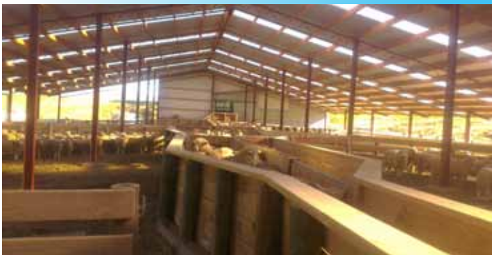
New Covered yards at Bullock Range - after the snows of Winter 2013