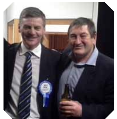
Chatting up the Minister of Finance?