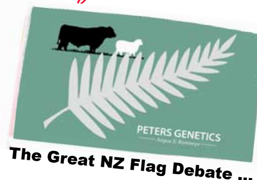
The Great NZ Flag Debate ...