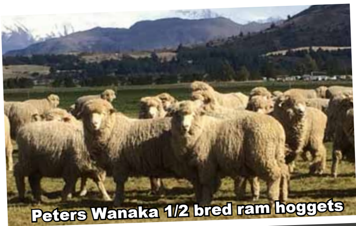
Peters Wanaka 1/2 bred ram hoggets