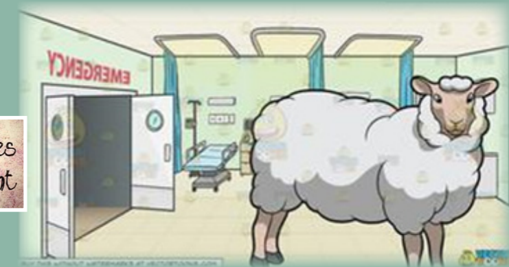
Peters Genetics has "Bounce-Back Ability"